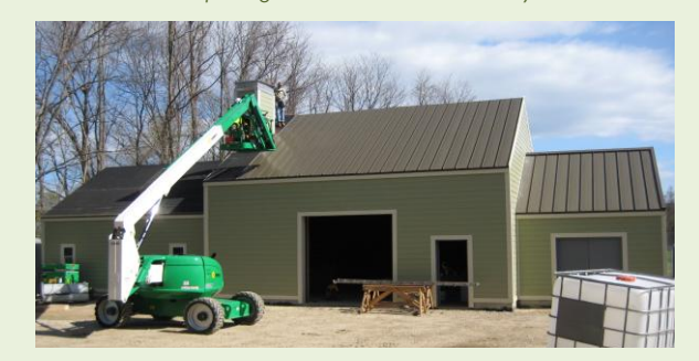
During construction, 240 tons of soil requiring excavation was transferred and stockpiled at a nearby municipal property for use by the Port Jefferson Highway Department. Prior to transfer, analytical tests were conducted on the soil to assure no residual contamination.